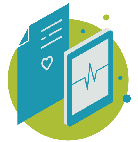
Digital Prevention, Monitoring & Therapeutics