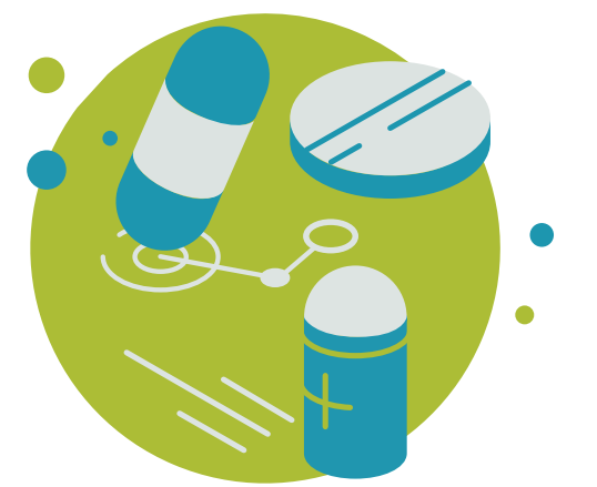
Clinical trials digitalization